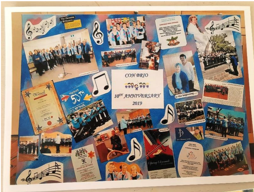
The board made up for the choir's 10th anniversary concert and party in 2019, at Yarralumla Uniting Church, showing various photos of the choir through its history.