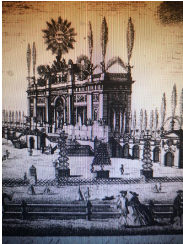
The stage especially constructed in Green Park, London, for performance of Handel's 'Fireworks Music'

The Orchestra is now working towards a concert in September to be held at All Saints Church, Ainslie. This is an exciting initiative of the Canberra Mandolin Orchestra (CMO) in collaboration with us, the Canberra Recorder Orchestra (CRO). Among our pieces will be Handel's 'Music for the Royal Fireworks' written in 1749.