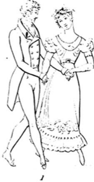
Manner of taking hands in The Quadrille

You are invited to join the U3A Historical Dance group Fridays during ACT school term time 11 am – 1pm at the Yarralumla Uniting Church Hall.