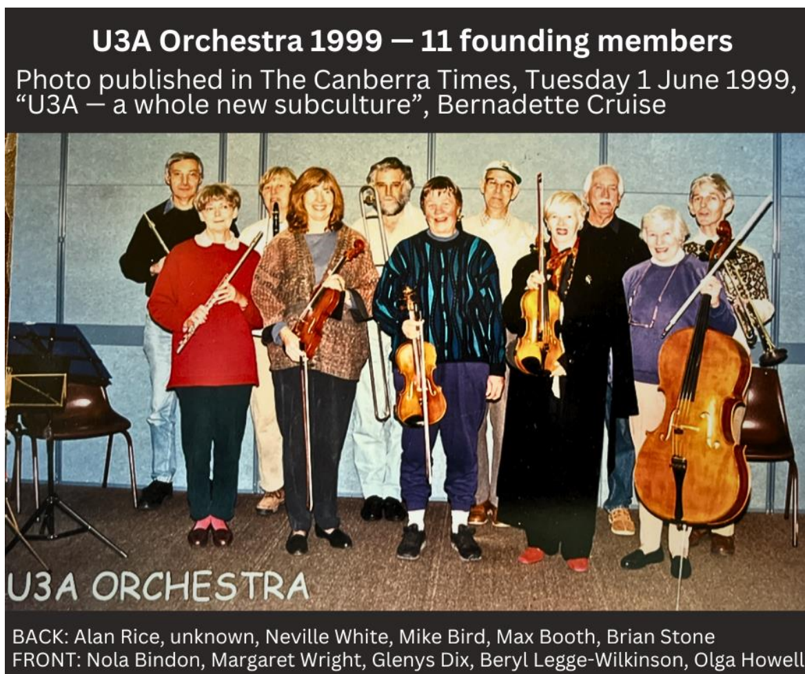
Photo below of the original players of the U3A Orchestra.

More information about the early days of the U3A Orchestra will be presented in the August newsletter and a new page will be added to the website and will feature the orchestra's history.